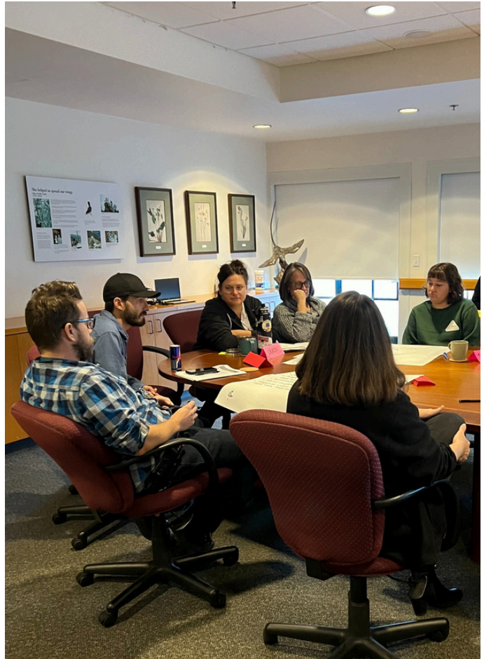
San Diego Natural History Museum

These initiatives are shaping more confident, capable leaders who are equipped to drive lasting change and create supportive environments. We're proud of the progress made and look forward to expanding our reach in the year ahead.