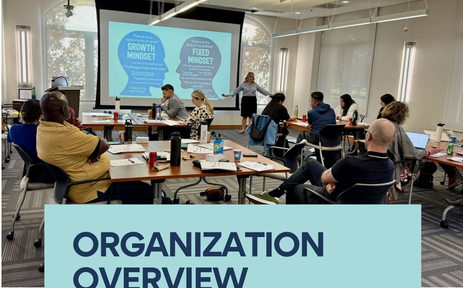
San Diego Foundation