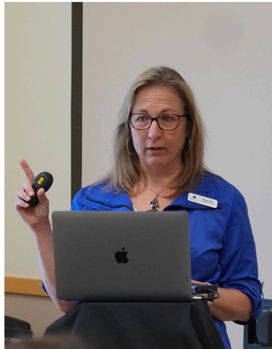
Nonprofit solutions' VP of Learning and Development at the San Diego Humane Society

Building on the success of our existing workshops and services, we plan to introduce new, innovative training modules and resources that respond to the evolving needs of our clients.