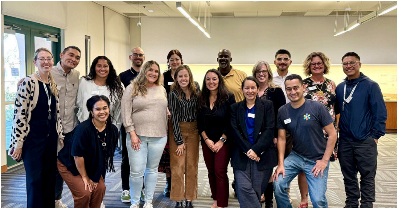
San Diego Foundation